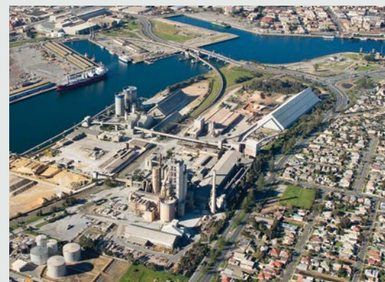
The Birkenhead Plant is a proud South Australian company with over 100 years of history at Birkenhead. The plant is strategically located adjacent to deep water port facilities, enabling receipt of limestone from the Yorke Peninsula and for export of cement to the eastern states.

Further information around improvements can be found on our website.