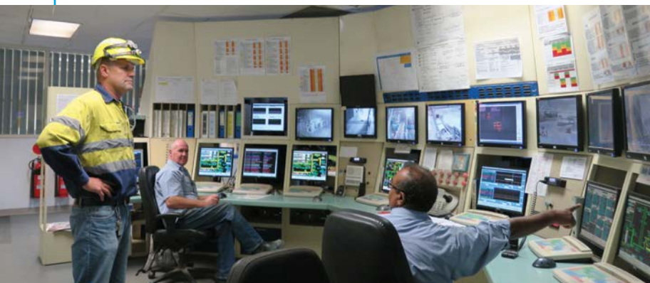
The Birkenhead Plant is centrally controlled and continuously monitored.

Further information about emissions improvements can be found on our website www.birkenheadcommunity.com.au